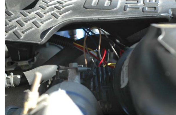
Figure 2.1. Boost Sensor Located right under Top engine Cover Trim. It is generally not necessary to remove this for installation of our unit.