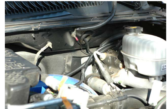
Figure 3.1 Grounding Location for Chevrolet Duramax