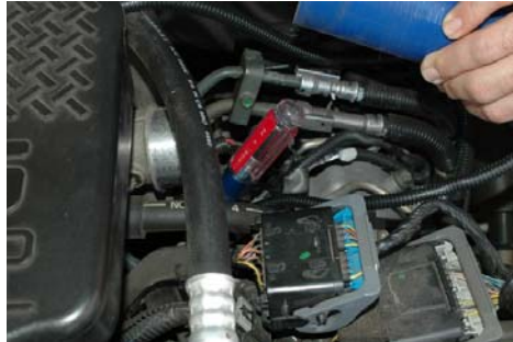
Insert screwdriver into clip for connector