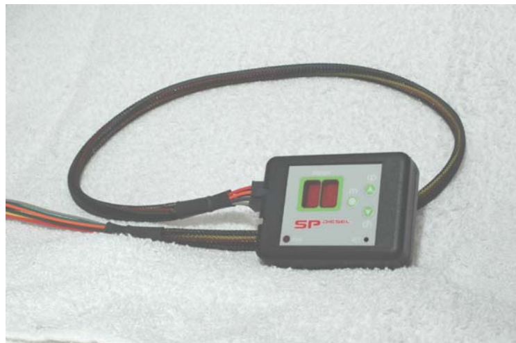
SI/SII/SIII - Performance Modules with Integrated Display Features and Add-On capability

Installation Directions & User Manual – Chevrolet Duramax Diesel LB7 and LLY/LBZ Motors