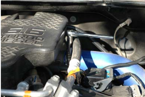
Loosen Intercooler Boot